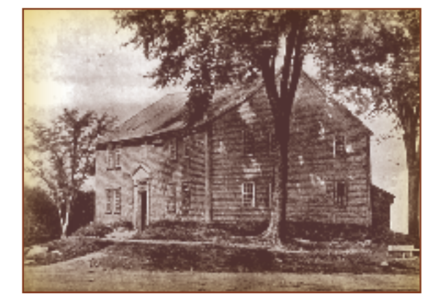
In this "time-shattered" house the first 45 members of the Hopedale community survived their first winter together. As their village grew, members continued to live communally, sharing meals, chores, and profits from businesses.