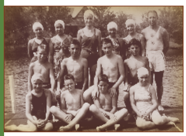
Hopedale Pond provided water power for the mill and recreation for town residents.

In 2009, the Little Red Shop was reopened as a museum that celebrates the story of the Draper Mill and the Town of Hopedale.