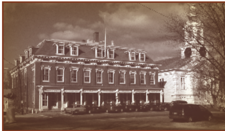
On the northern side of the Grafton Common is the commercial center, anchored by the Town House, seen here with the Unitarian Church. Along with its businesses, the Town House also is home to the Grafton Historical Society where more of the town's fascinating stories can be learned.