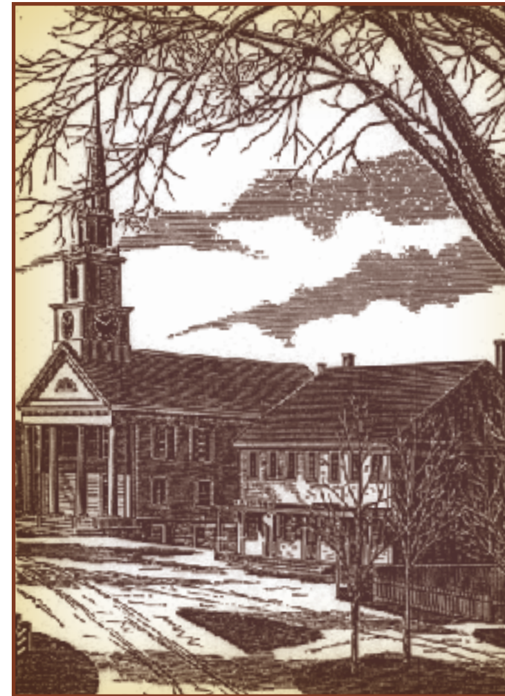
The Second Great Awakening gave voice to those who criticized Congregationalism for focusing on a Scriptured, Heaven-bound elite, leaving the rest behind. The Baptists, emphasizing faith and universal salvation, tended to appeal to working people who hoped God cared more about piety than education and wealth. The Unitarians, stressing human reason and ability, often drew upwardly-mobile entrepreneurs who hoped “social engineering” would promote profits without worldly sin and conflict. When Grafton’s parish embraced Unitarianism in 1831, appalled church members withdrew, taking church records, furniture, and the communion plate.