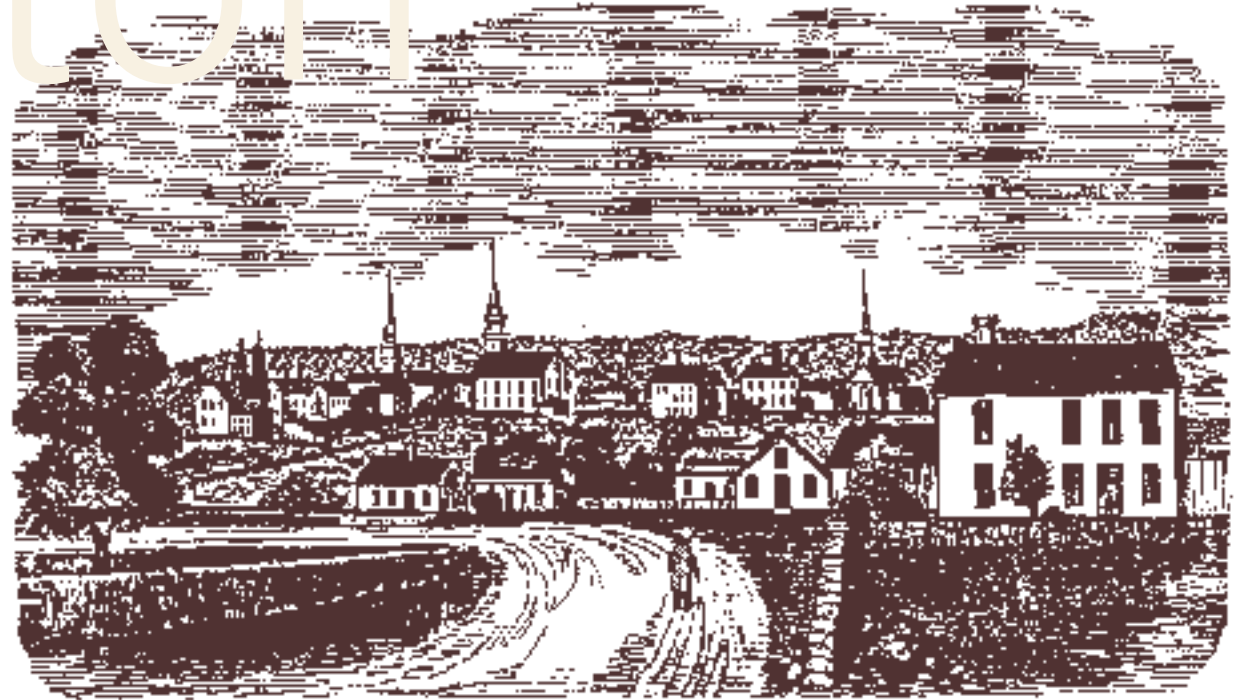
Grafton Center, from South Street, in 1839.

In the 1800s, Grafton built upon its agricultural base, developing its industry. It not only became a national leader in leather tanning and currying, but also in boot and shoe