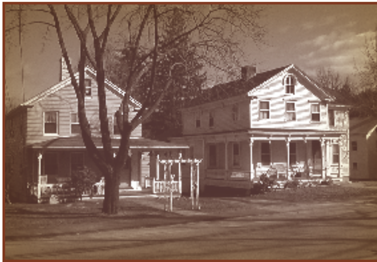
The handsome “50¢ houses” along the East Side of South Street, once the site of shoe mills and worker tenements, stand in stark contrast to the grandeur of the mill owner homes located across the street.

Grafton Center was once the site of a thriving shoe and leather industry. Unlike the massive water powered textile mills along the Blackstone in South Grafton, the leather manufacturers were located in small shops or houses particularly along South and North Streets where hand tools and muscle power did the work. In 1837, Grafton led Worcester County in boot and shoe production. In 1866, there were 10 shops making boots and shoes, two tanneries and several other leather goods establishments around the Center. These were small concerns, most employing 10-15 workers. Shoe and boot making continued to thrive here until the 1880s, but had ended by 1925 no longer able to compete with larger, more mechanized mills.