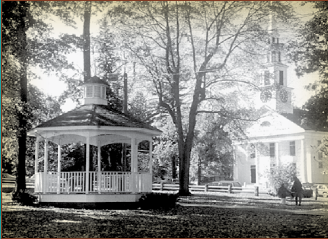
Grafton Common.

Take a stroll through a classic New England town and imagine yourself transported through time. . . to the moment of the shopkeepers' millenium.