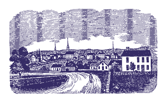
Grafton Center, from South Street, in 1839.

A lack of waterpower at Grafton Center allowed the center to develop into what it is today. Grafton investors built mills on the Blackstone and Quinsigamond rivers, creating new village centers in Fisherville, Farnumsville, Saundersville, Kittville, Centerville and New England Village. Each of these villages has its own fascinating story to tell, but it is also important to recognize how