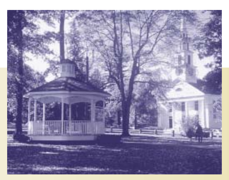
Take a stroll through a classic New England town and imagine yourself transported through time... to the moment of the shopkeepers' millenium.