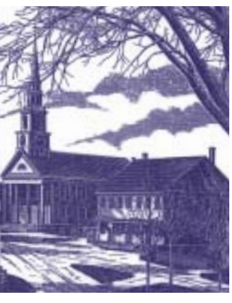
The Second Great Awakening gave voice to those who criticized Congregationalism for focusing on a Scriptured, Heavenbound elite, leaving the rest behind. The Baptists, emphasizing faith and universal salvation, tended to appeal to working people who hoped God cared more about piety than education and wealth. The Unitarians, stressing human reason and ability, often drew upwardly-mobile entrepreneurs who hoped "social engineering" would promote profits without worldly sin and conflict. When Grafton's parish embraced Unitarianism in 1831, appalled church members withdrew, taking church records, furniture, and the communion plate.

The passion of this conflict is displayed here at the Grafton Common where