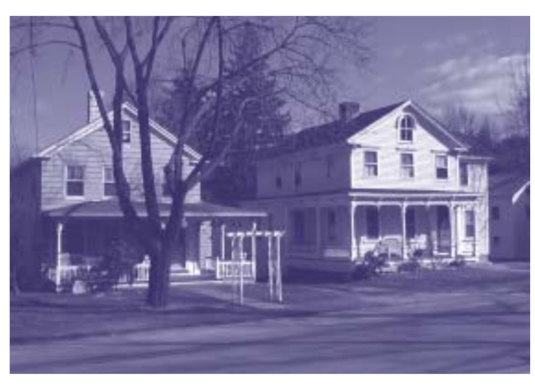
The handsome "50¢ houses" along the East Side of South Street, once the site of shoe mills and worker tenements, stand in stark contrast to the grandeur of the mill owner homes located across the street.

As you look down South Street, the economics of the leather industry can be readily seen. To your right on the west side of the street stand the impressive homes of many of the boot shop owners. Across the street to the east are many of the old shops, now converted to housing, along with the tenements that housed the workers. Locals often speak of these as the "dollar houses and the 50¢ houses."