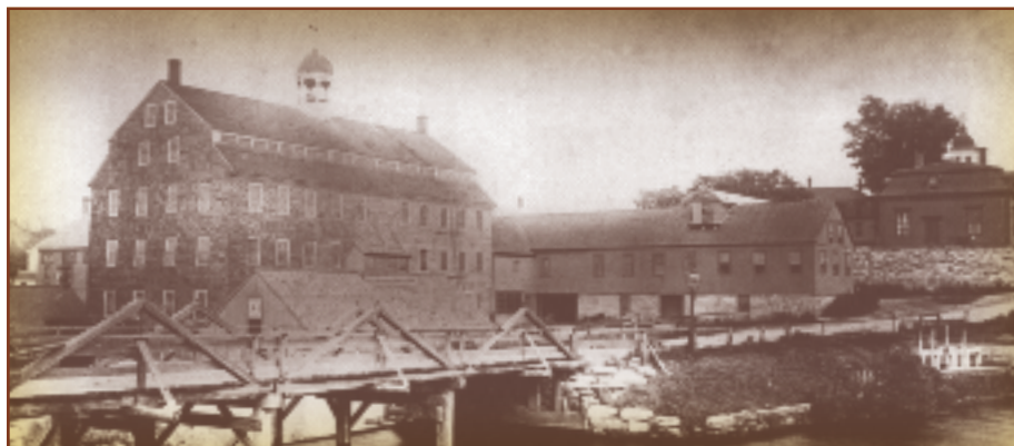
The Lovett Mill, as it appeared in 1885 when it was being used as a machine shop for the Douglas Axe Company. The building pictured in the far right of the photograph is the Axe Company office, now the Elmwood Club Restaurant.