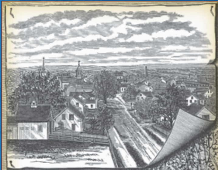
Bird's eye views of Douglas.

Where fields met factories and country met commerce.