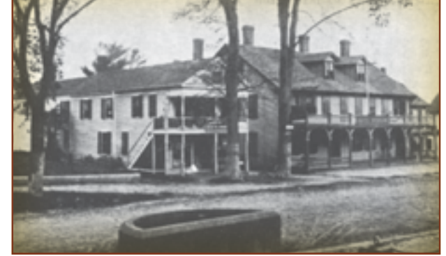
Rogerson Building left, Douglas Hotel right

it into tenements, which they owned until 1940. The eastern ell (#306) was detached c. 1922 and made into a gas station. Recently the station was converted into a restaurant and shops.