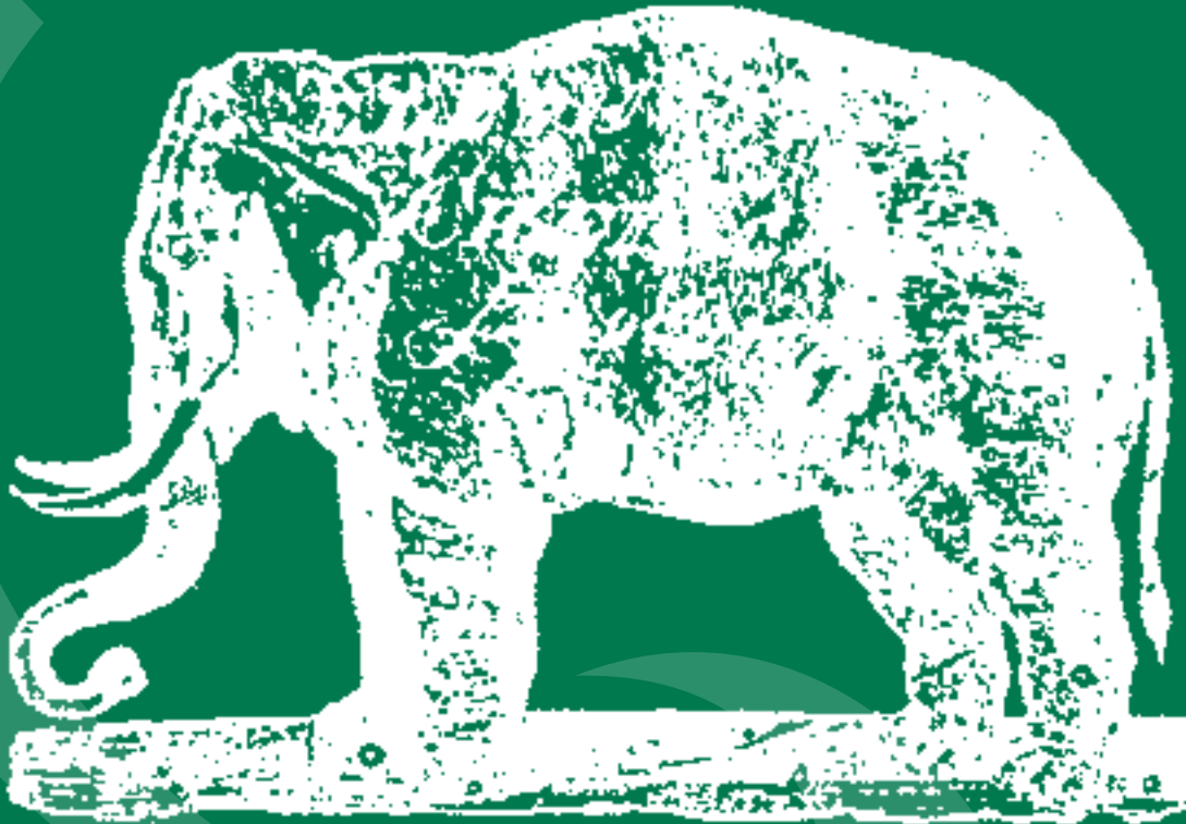
1822 roadside promoting the performance of Betty The Learned Elephant.