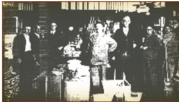
Crossroads inevitably create commerce, and by 1813, there were 13 dry goods and grocery stores in Chepachet village. The goods for sale today at Brown and Hopkins Country Store (operating under this name since 1929) are stacked on shelves and counters that have endured nearly 200 years of practical use.

Downstream, the Chepachet weds the Clear River, forming the Branch River. It joins the Blackstone River which eventually empties into the sea.