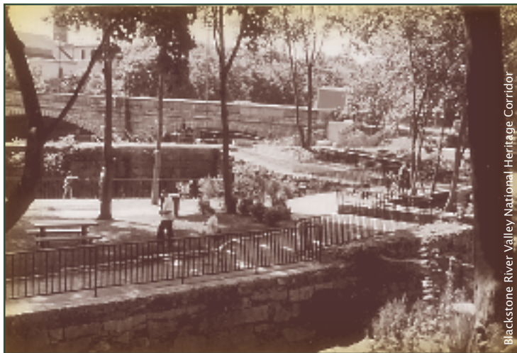
Blackstone River Valley National Heritage Corridor