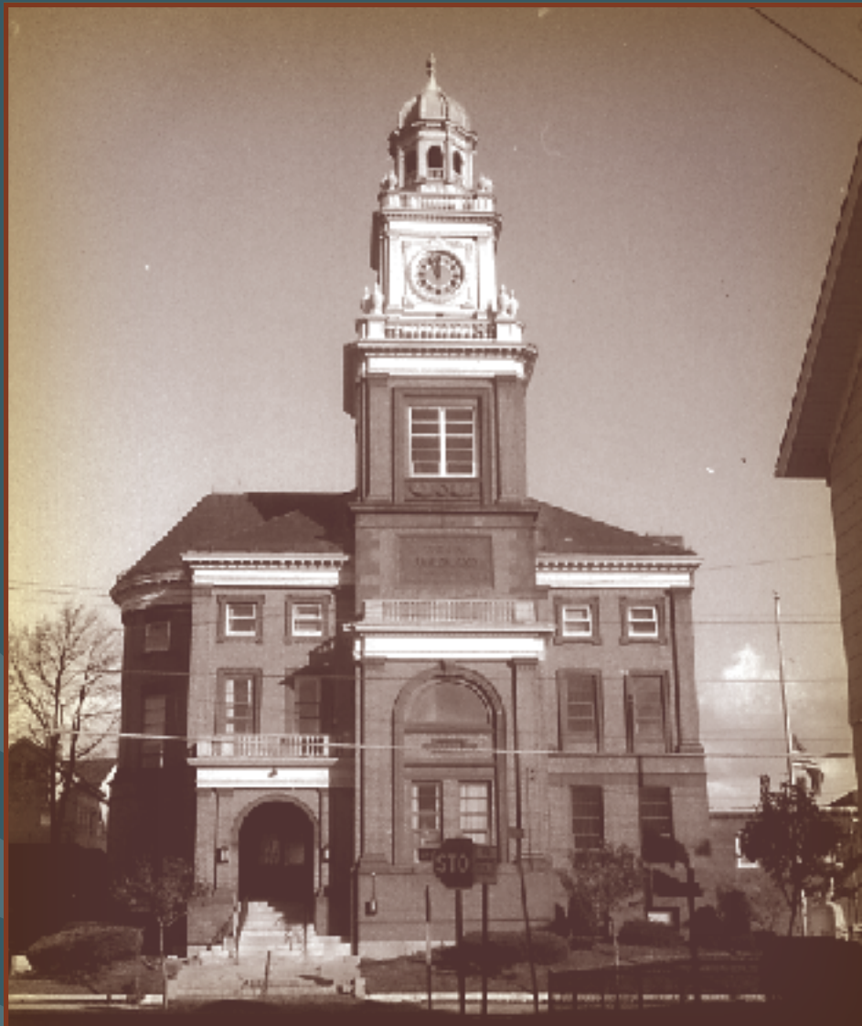
Cumberland Town Hall.