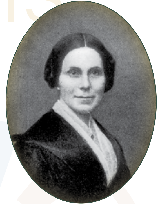
Elizabeth Buffum Chace was one of Rhode Island's leading reformers during the 19th century. Her earliest activities were in the abolitionist movement, inspired by her strict Quaker beliefs. Later she became active in campaigns for women's suffrage and temperance and also played a key role in reforming the state's prison system.

The Valley Falls Company Mills shut down in the 1930s, ending an important phase in the history of both the village and the town of Cumberland. Despite this loss, Valley Falls continues to be the urban center of Cumberland. So while the site of the old mill has been turned into a park, the thriving business along Broad Street and the presence of the active Portuguese community here provide a taste of what Valley Falls was like during the textile boom years.