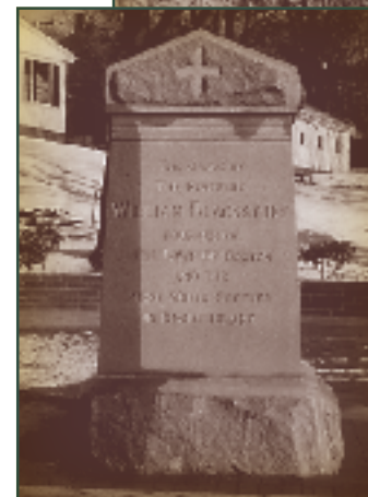
Left: The Reverend William Blackstone, the first English settler in the Blackstone Valley, built his home along the banks of the river in what is now the Lonsdale section of Cumberland in 1635. Blackstone, who was also the first settler of Boston, came here after falling into disagreements with the Puritans. His home, known as Study Hall, was burnt during King Philip's War, shortly after his death in 1675. A granite marker that is said to have marked Blackstone's grave now stands across the street in the William Blackstone Memorial Park.

Below: The mills along the Blackstone have caused many problems for the river's fragile ecosystem over the past two centuries. However, the Industrial Revolution has also led to a few improvements for the river's wildlife. The Valley Falls Marsh, created by flooding caused by the Valley Falls Dam, is the largest fresh-water marsh in Rhode Island. The marsh is an important stopping point for migrating birds on one of the great northeast fly ways, and each spring several breeds of waterfowl, including Canadian Geese, Mute Swans, and Mallard Ducks, use the marsh for their nesting grounds.