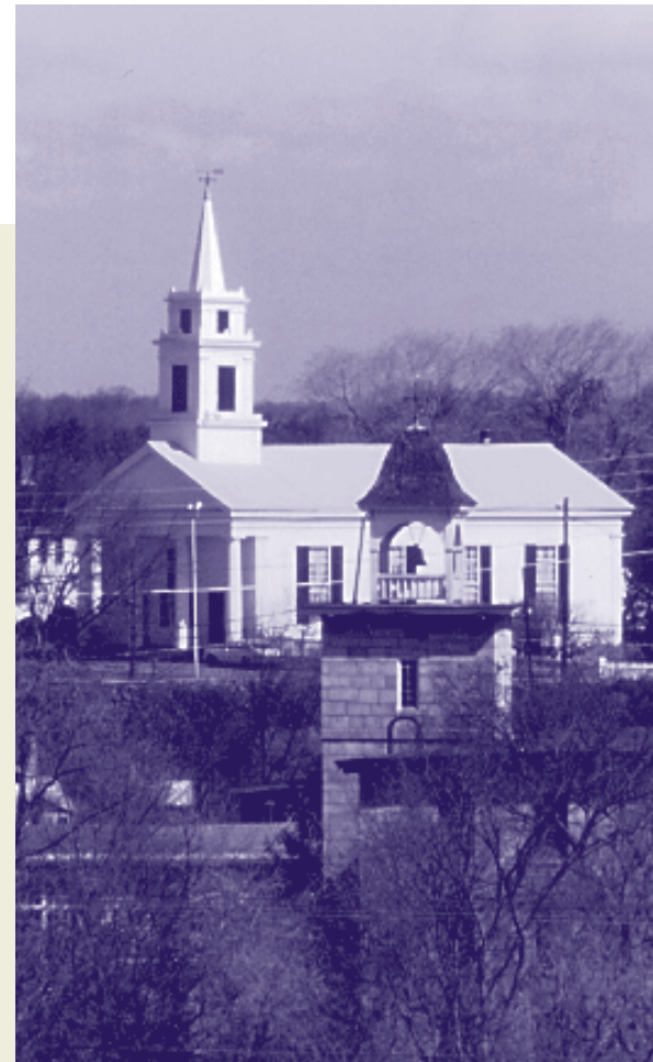
America's first textile village.