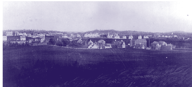
View of Slatersville c. 1860, looking north from Tabor Hill. The Center Mill can be seen in the right foreground. In the background is Main Street and School Street, including the First Commercial Block and the Congregational Church.