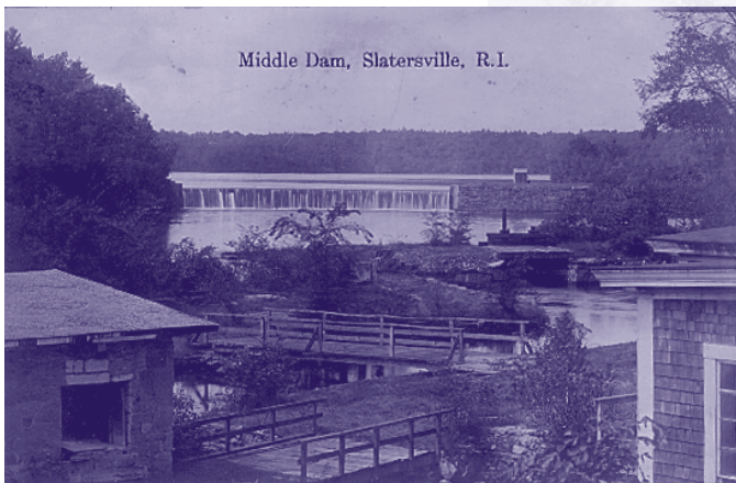
Middle Dam, Slatersville, R.I.

Slatersville Middle Dam, c. 1900. In the foreground is part of the Western Mill complex, along with the system of canals that powered it.