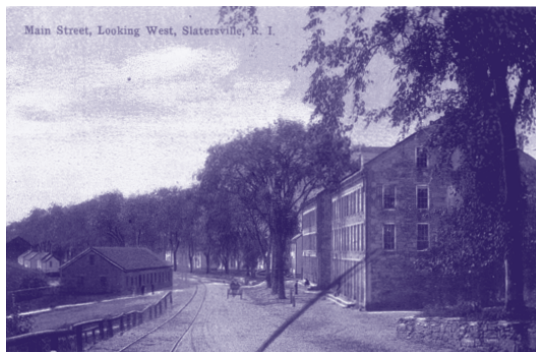
Main Street, Looking West, Slatersville, R. I.

In 1821, the Slaters built an eight building mill complex, known as the Western Mills, on the western side of Railroad Street. Two of these buildings remain. One, the former store house, became the North Smithfield Public Library in 1966. Its rubble-stone construction shows us what the old Western Mill complex looked like. Proceed down the stairs to the left of the library and head east along the power canal to the former picker house that is currently not in use.