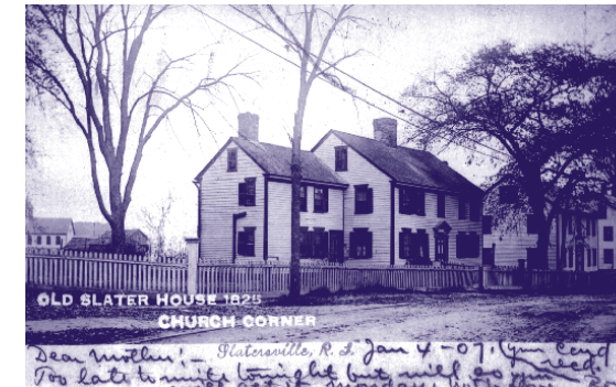
John Slater House.