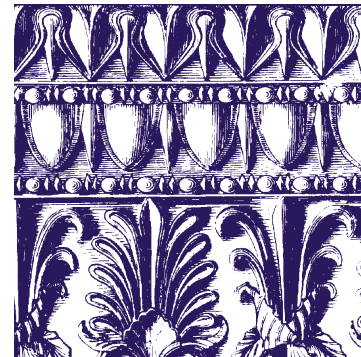
Egg & dart with anthemion & palmette designs