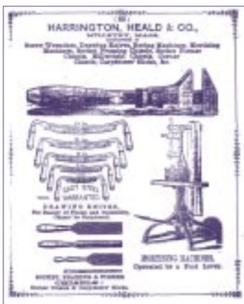
While both genders worked in the textile mills, only men and boys were employed in Millbury’s iron-working shops, like the edge-tool business advertised here in 1881.

Millbury began as Sutton’s Second or North Parish in the 1700s, the industrial district of a farming community. Throughout America, ninety percent of all Americans tilled the soil, while most manufactures were imported from Europe or hand-made by artisans. Recognizing the industrial potential of Sutton’s north-