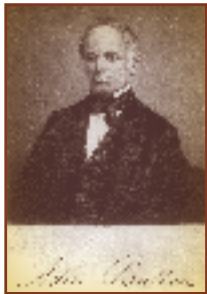
Reverend Adin Ballou, a Unitarian clergyman from Mendon, was the guiding spirit for the Practical Christians who founded Hopedale. When the original community disbanded, he wrote, "The great question involved in our Hopedale experiment is not yet settled; only postponed to a wiser and better time."

The story began when Universalist Reverend Adin Ballou and forty-four followers purchased a 258 acre farm in an area long known as "the Dale", located on both sides of the Mill River in the town of Milford. There they established "Fraternal Community No.1," launching what they hoped would be an ever growing number of Practical Christian communities that would transform the world.