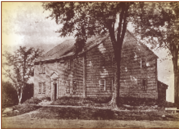
In this "time-shattered" house the first 45 members of the Hopedale community survived their first winter together. As their village grew, members continued to live communally, sharing meals, chores, and profits from businesses.