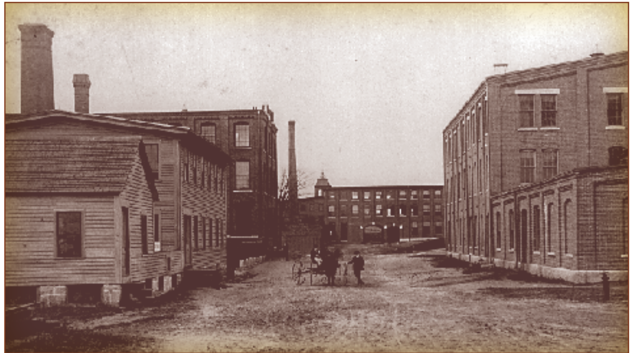
In 1887, the Drapers cut the work week to fifty-five hours, more than a decade before Massachusetts made those hours a state requirement. Well into the 20th century, residents regulated their lives according to the company's bells which rang at 6:00 a.m. to wake people up, 6:55 a.m. to alert employees to report for work, 12 noon for lunch, and 12:55 to remind employees to return to work. A 9 p.m. bell served as a curfew for most of the town's youth.