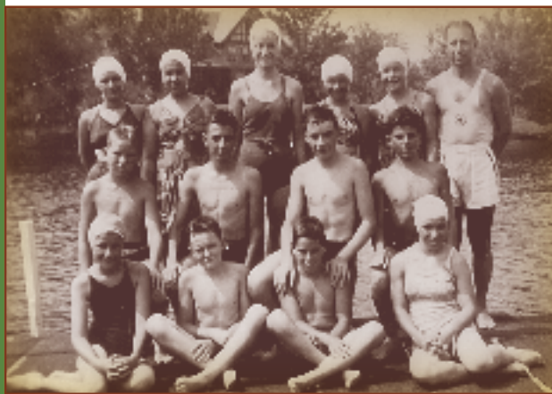
Hopedale Pond provided water power for the mill and recreation for town residents.

In 2009, the Little Red Shop was reopened as a museum that celebrates the story of the Draper Mill and the Town of Hopedale.