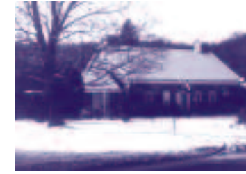
The Butterfly Mill.