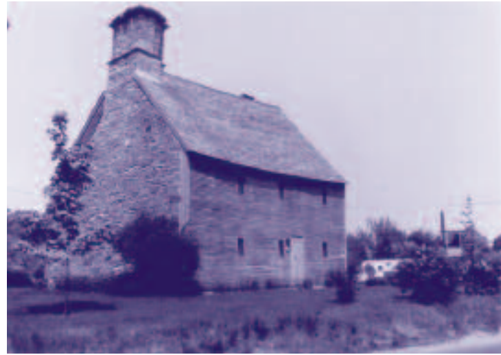
Eleazer Arnold House c. 1687.

Total distance of the tour is 3.25 miles. Driving Tour time is about one hour.