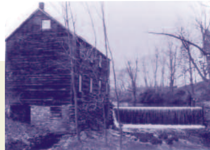
Travel through three hundred years in three miles.