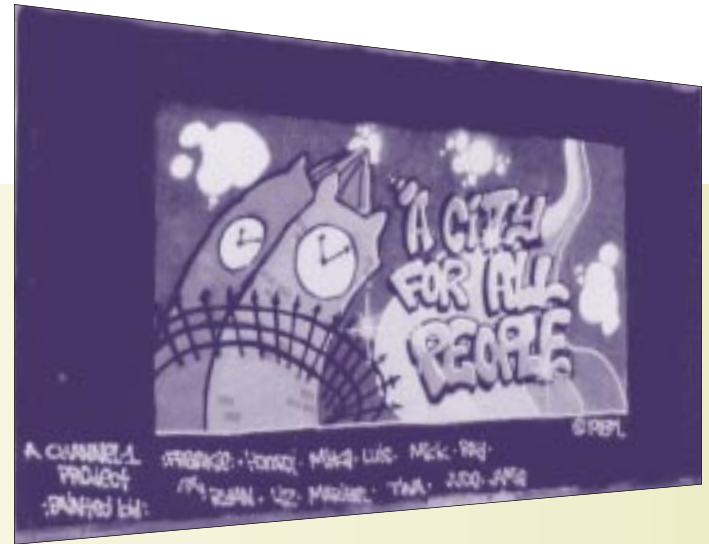
“A City for all People”

This brochure was developed under the direction of The Rhode Island Historical Society in partnership with the Heritage Corridor Commission.