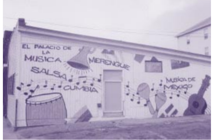
El Palacio De La Musica Mural: Dexter Street.

Turn right onto Dexter Street. Turn right onto Hunt Street then right onto High Street. Continue on High Street to Pierce Park which is on the left side.