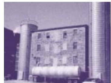
Pawtucket Thread Company (1825) Four story stone mill now hidden by the massive brick mills that surround it.

From Slater Mill: Turn right onto Roosevelt Avenue. Proceed about 1/3 of a mile. Mill district begins at Central Falls Line.